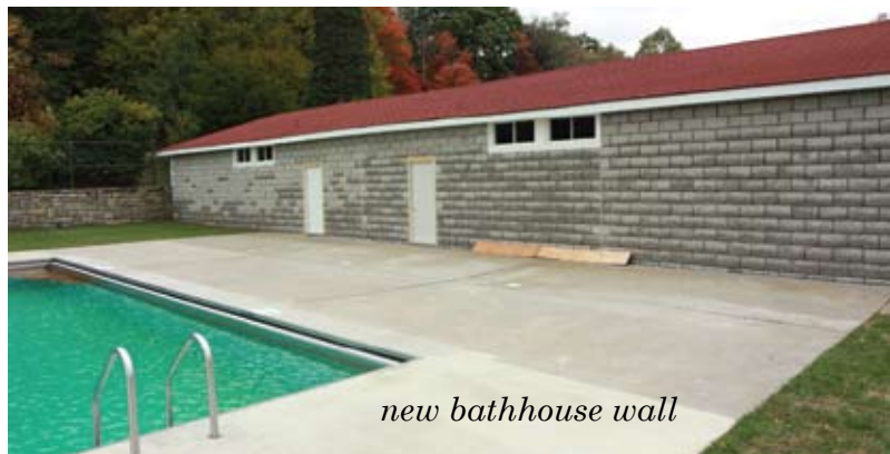
new bathhouse wall