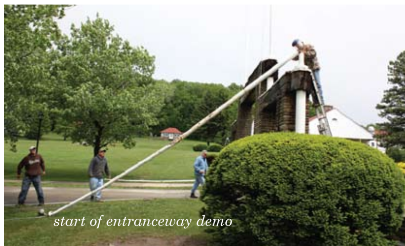
start of entranceway demo