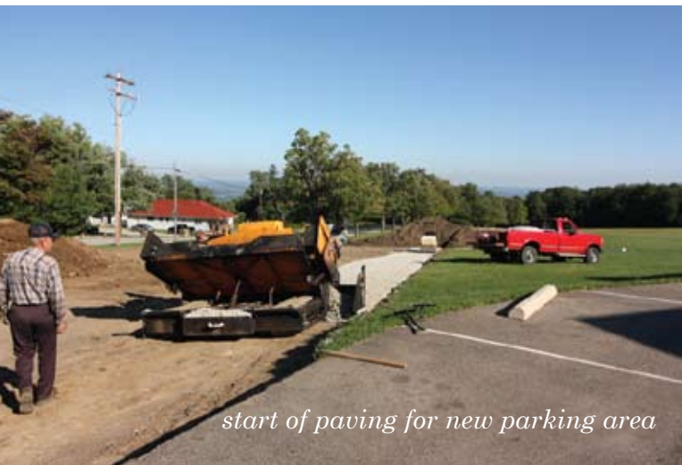
start of paving for new parking area