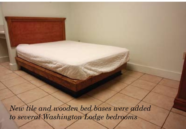
New tile and wooden bed bases were added to several Washington Lodge bedrooms