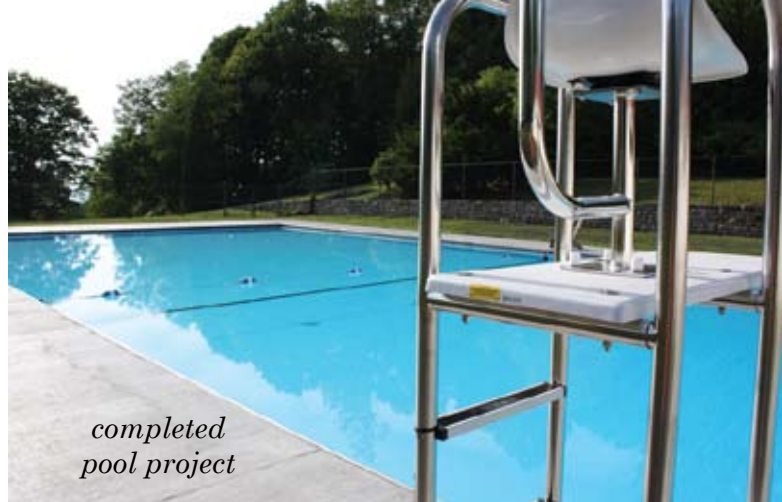
completed pool project