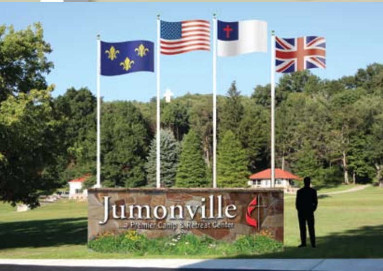
The new entrance design incorporates a stone wall, flags, and a great photo opportunity with the view of the Cross on the Mountaintop. The entrance will also be lit at night.

A PUBLICATION FOR OUR SUPPORTIVE FRIENDS