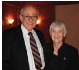
Special thanks to Jim & Nancy Gnagey for their very generous gift

The sidewalk between the new entrance and Asbury Dining Hall has deteriorated over the years and is in need of replacement at a cost of $5,000. An additional $2,500 is needed for a ramp to the dining hall to better accommodate our guests who use wheelchairs or walkers, or who have difficulty with steps. And finally, $2,500 is needed for new signage for the parking areas to help arriving guests follow the flow of traffic and to find parking areas on campus.