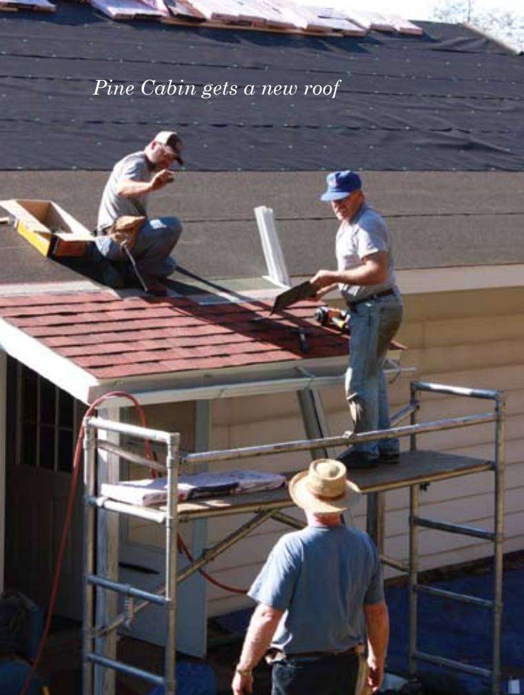
Pine Cabin gets a new roof