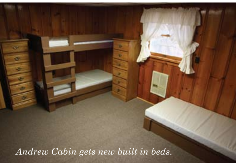
Andrew Cabin gets new built in beds.