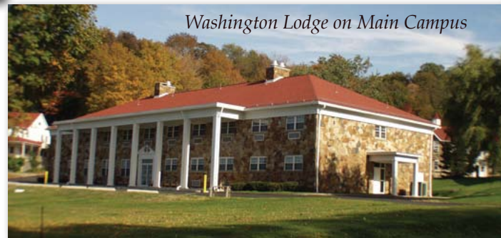
Washington Lodge on Main Campus

The Inn at Jumonville (hotel-type bedrooms with 2 double beds per room and a private bath) is scheduled by Family Week. There is an additional lodging charge for those who stay in the Inn. Persons who have been housed in the Inn in the past are given preference in the housing arrangements; however, if you are interested in staying in the Inn if space becomes available, please check the box on the registration form.