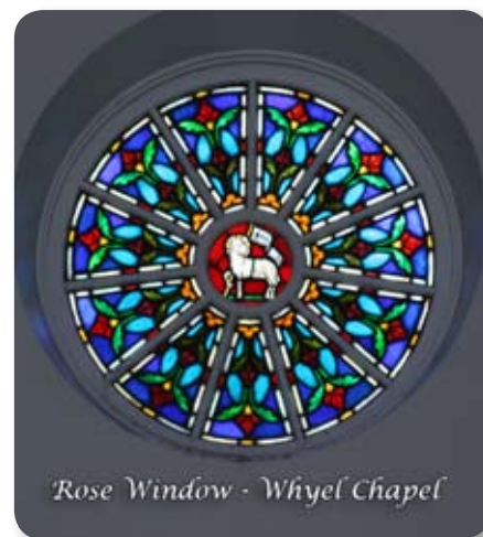
Rose Window - Whyel Chapel