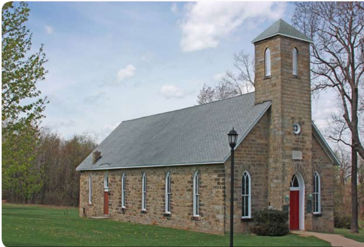
An artist's rendition shows the new look of Whyel Chapel with the proposed redesign of the bell tower roof and louvers over the arched windows in the side of the bell tower. The entire roof is also scheduled to be replaced.

The Spirit is strong, but the flesh (of the building itself) is weakening. For nearly 130 years it has stood strong on the mountaintop; however, the bell tower roof has begun to rot. Because it is open on the top, with a series of small flat roofs to divert water, the continual accumulation of leaves, rain, snow, and ice have deteriorated its ability to protect the interior from the elements. Because of the small drain holes repeatedly becoming clogged, it is felt that an external roof would better solve the